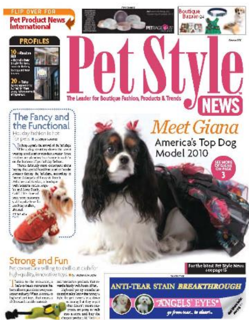
Pet Style News Cover

America's Top Dog Model® 2016 contestants will be selected on their leadership qualities and best portrayal of their favorite politician, including presidents, first ladies, and prominent political figures, past and present. Contestants can also be original, and develop their very own Paw-litician to introduce to America.