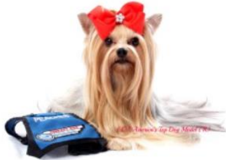
Peaches, America's Top Dog Model® 2015 National Contest Winner